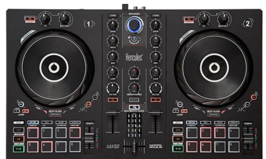
DJCONTROL IMPULSE 300