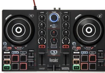
DJCONTROL IMPULSE 200