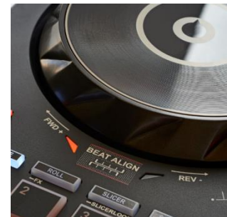
LEARN TO EASILY ADJUST THE BPM (beats per minute) Follow the TEMPO arrows to adjust the song's BPM.